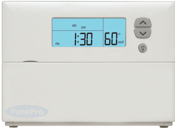
Easy-to-read backlit digital display.