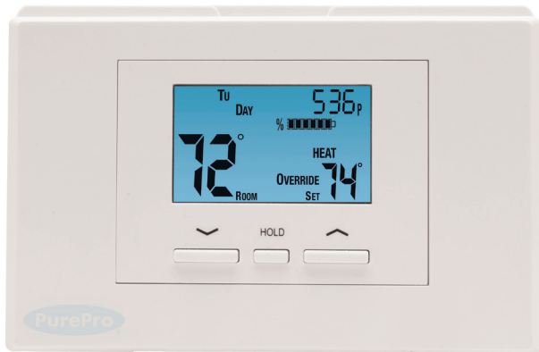
Easy-to-read with backlit display.