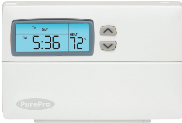
Easy to program with large LCD display.