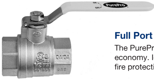
NPT shown here.