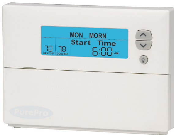
Easy-to-read backlit digital display.