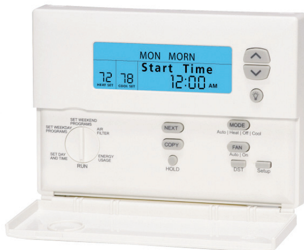
7-day programming, 4 periods per day. Auxiliary and emergency heat indicators.