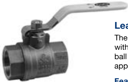
NPT shown here.